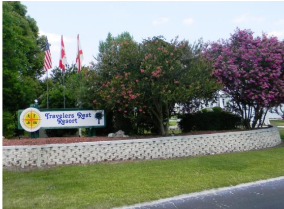
The park is in full bloom

It's June already and the summer will fly by very quickly. Contrary to popular belief, TR is always a great place to summer in. It's like having a private resort almost all to yourself.