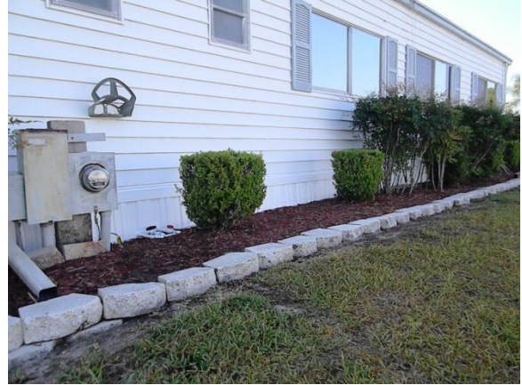
West side of the corporate office with the under-pinning completed.

This was a very well done job, looks great and will keep the animals out from under the office.