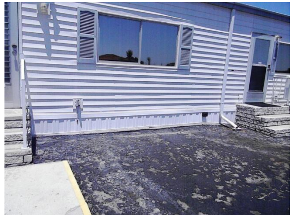
Under-pinning completed on the East side of the corporate office.