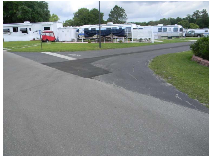
Same section after repairs

Volunteers also reworked the chipping green by removing the grass, and adjusting the approach.