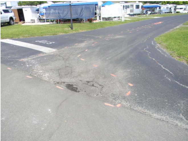
Patch work marked for repairs corner of 17 th and 3 rd .

Some of the projects that were and are being done include the patching of the streets in RV South. The street patching must be done before we can repave which we will do as soon as possible.