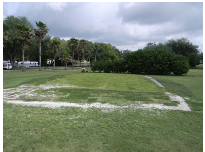
Chipping green after rework and sod relayed