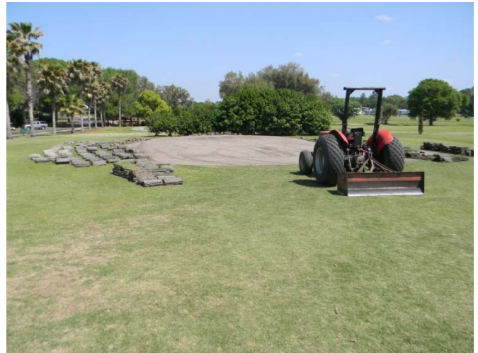
Chipping green with the grass removed being reworked

Volunteers also reworked the chipping green by removing the grass, and adjusting the approach.