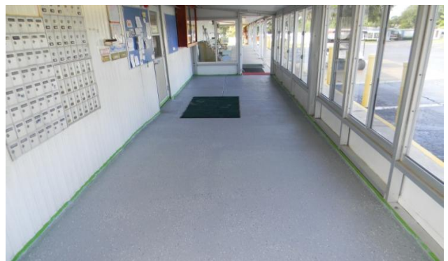
Post office lobby floor got repainted

The summer months are always a very busy time for the TR staff. Between the constant mowing, trimming and other general duties, we also take this time to do major projects and upkeep to the buildings.