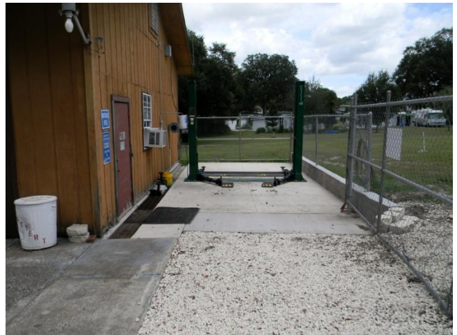
Equipment lift installed at the south end of the maintenance building.

The electric lift was installed on the south end of the maintenance building and salvageable portions of the old fence and gate system were revamped to provide a security area around the lift.