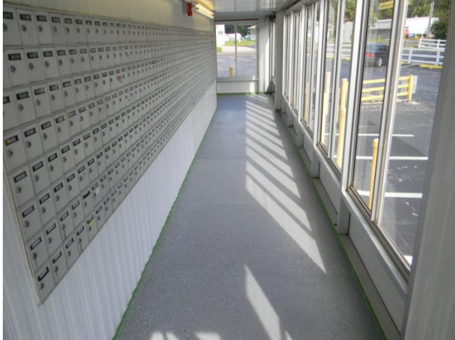
North lobby of the Post Office