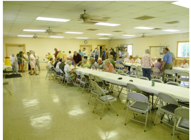
Time to sit, eat, and enjoy each other.

Its times like this that just make TR such a special place.