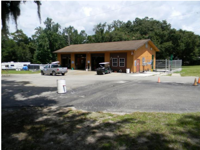
Entrance area to the maintenance without the fence and gate that previously had been in place.

A new combination lock has been installed and the combination is available to anyone holding a storage lease. It is obtainable from the TR office.