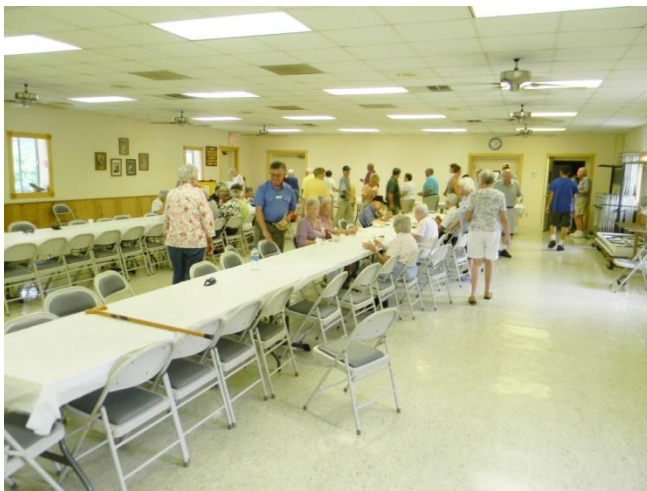
Making a mad dash to the serving table

Even though we have about 130 year round residents at TR, we don't always see each other that often.