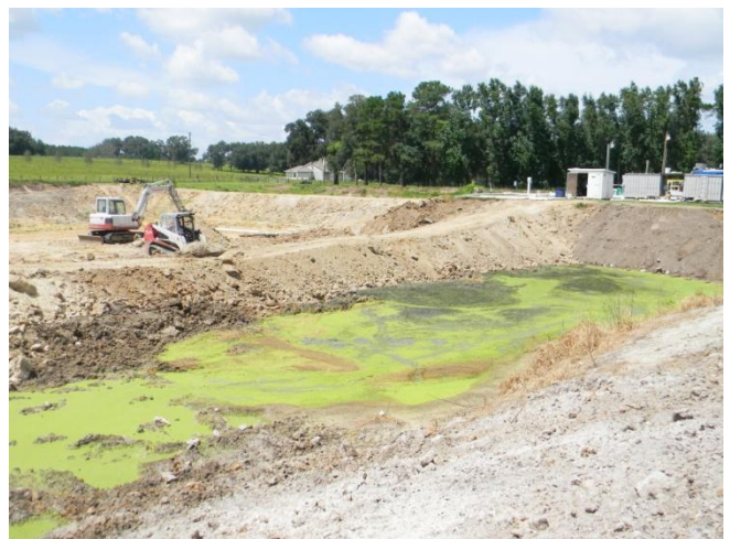
View from the service road of the berm dividing the center and southern ponds.