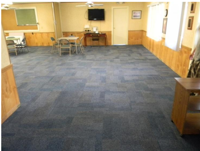
New carpet was installed and the floor braced.