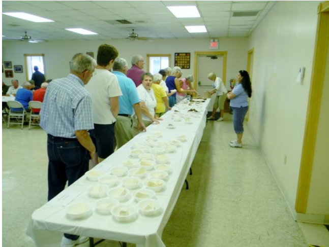
A long serving table with 7 different flavors to pick from

TR hosted our annual ice cream social on Wednesday August 31 in Citrus East. We had about 50 of the year round residents show up and we all had a good time visiting with each other and sampling some very good ice cream.