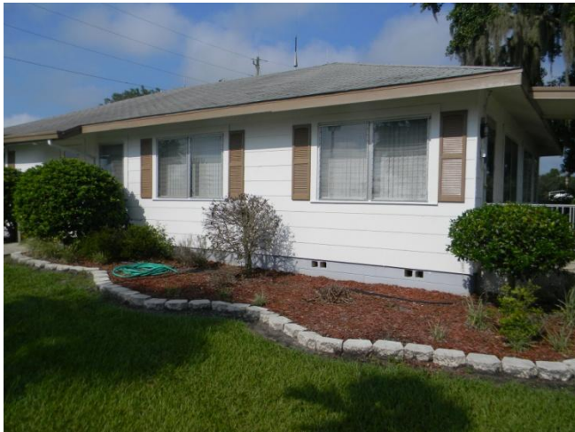
Hobby House was repainted and new shudders replaced