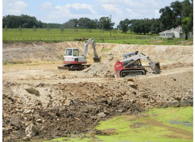
Creating a new reconstructed berm between the center pond and the southern pond

The SWFWMD mandated project requires us to be able to at any given time pump excess storm water run-off that has been collected in Vanishing Lake and move it to the southern pond in the newly created 3 pond project.