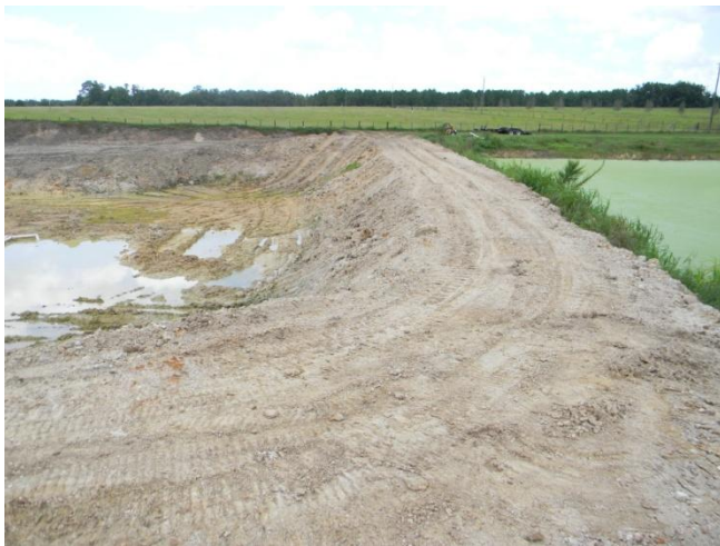
View of the northern berm between the northern and center ponds.