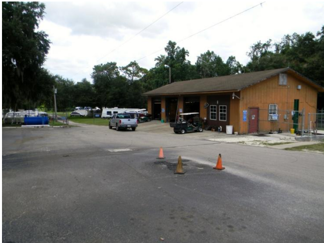
Another view of the access to the maintenance area.

During the month of July, our mowing equipment came up for lease renewal. We were able to obtain a new lease for new equipment at a considerable savings.