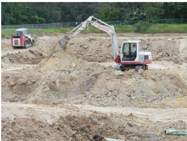
Moving the fill from the bottom of the center pond for berm material.