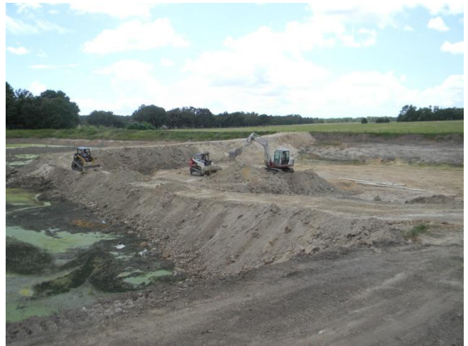
Center pond berm almost completed.