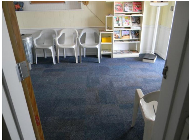
New carpet was also put down in the Laundry room foyer