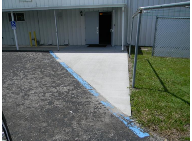
Cement pad was added to the back of the Laundry room foyer so sand and mud would not be tracked in from the clothes line area